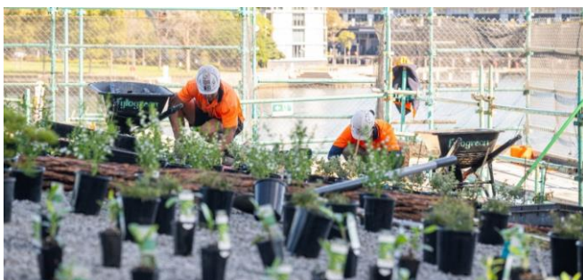
Above: Installation of the green roof