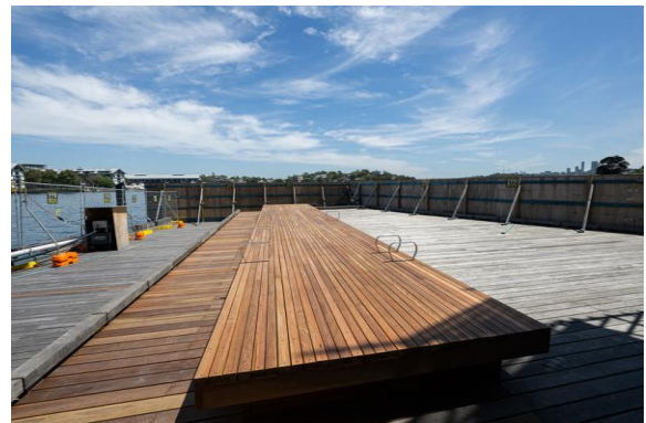
New timber seat at the pier's end