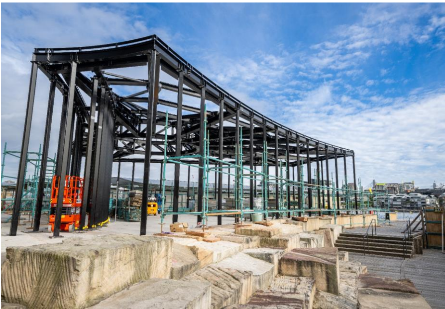
Above: Installation of the steel structure is now complete

Scaffolding has been installed around the perimeter of the steel structure, in preparation of the upcoming roof works required to install a green roof on the pavilion.