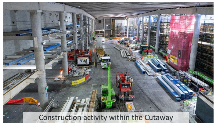
Construction activity within the Cutaway