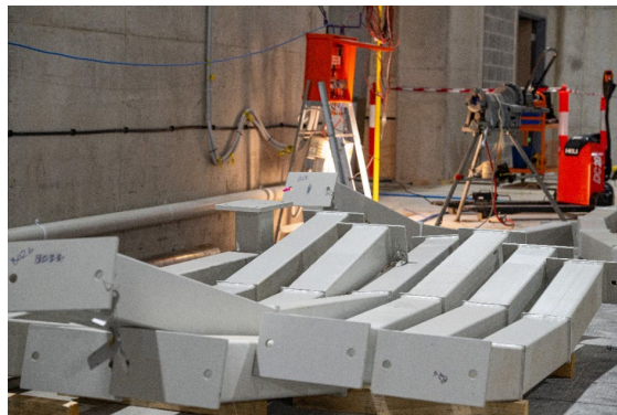
Steel floor-frame about to be installed

The health, safety and wellbeing of the community and our workforce remains our top priority throughout these works. The team is committed to working closely with surrounding neighbours to deliver the project safely, keep the community informed and minimise any potential impacts.