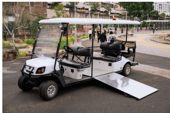
The Cutaway accessible buggy

For more information, visit: www.barangaroo.com/getting-here/related-pages/accessibility