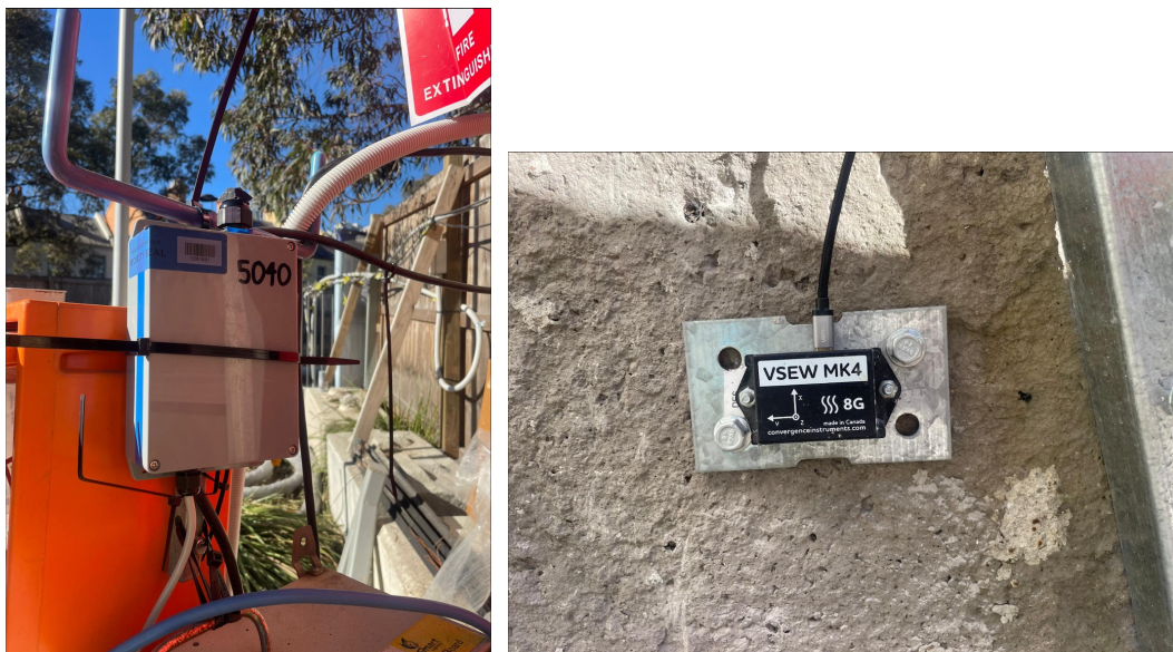
Figure 1 - Noise (left) and vibration (right) monitor installation, in situ.

As such, noise and vibration monitoring has been reduced to one sensor each, located in the vicinity of residential receivers along Merriman Street. Monitor locations have been chosen in line with “Option B” proposed in Figure 2 of the Acoustic Studios Letter Re: The Cutaway – Construction Noise and Vibration Management Plan (CNVMP) – Monitoring Program Update , dated 27 th May 2025. Specific details are provided below.